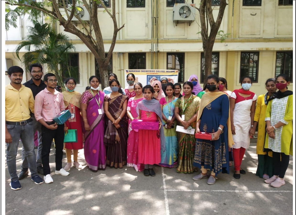
Memories with Winners